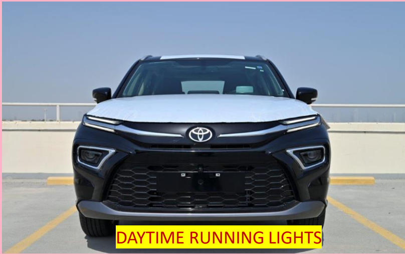
DAYTIME RUNNING LIGHTS