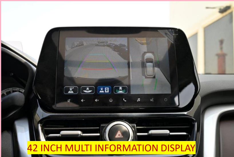
42 INCH MULTI INFORMATION DISPLAY